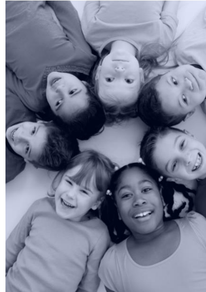
Safe and Healthy Children