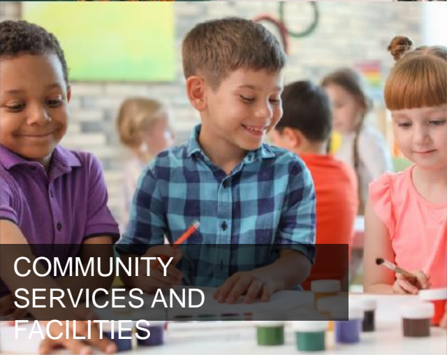
COMMUNITY SERVICES AND FACILITIES