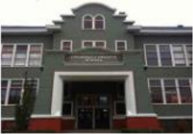
Building Communities Fund