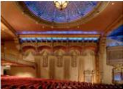
Building for the Arts