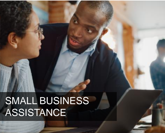
SMALL BUSINESS ASSISTANCE