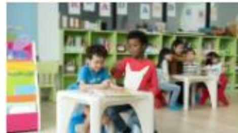
Early Learning Facilities Program