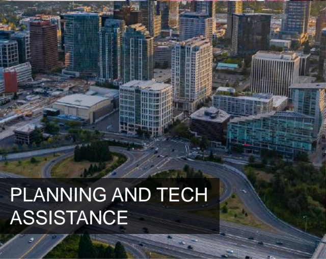
PLANNING AND TECH ASSISTANCE