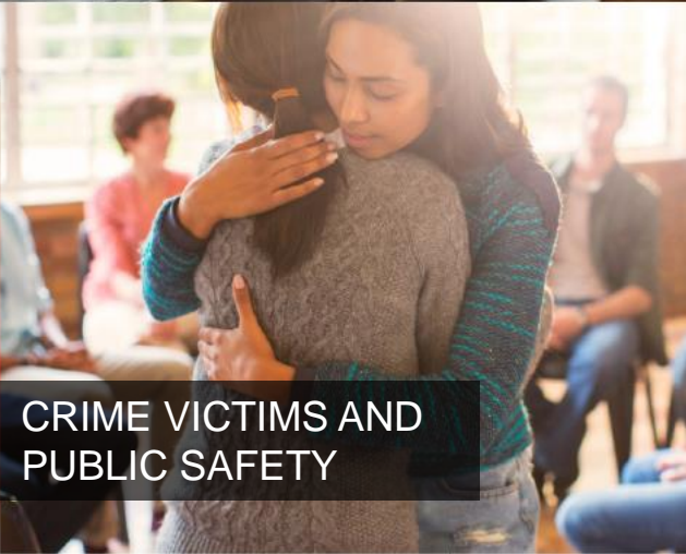
CRIME VICTIMS AND PUBLIC SAFETY