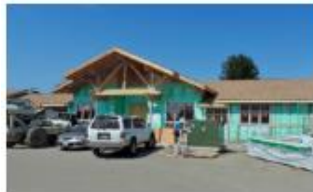
Behavioral Health Facilities