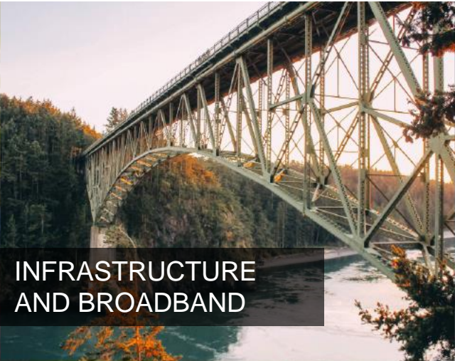
INFRASTRUCTURE AND BROADBAND