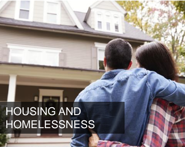
HOUSING AND HOMELESSNESS