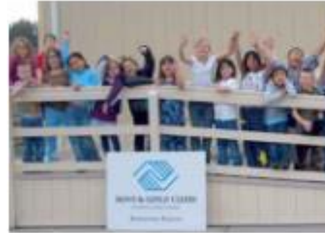
Youth Recreational Facilities